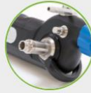
Universal high guide / cable connection

for camera application. Compatible with different camera TV coupler