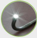
Stable guiding element

High-quality components „made in Germany“ High depth of field and homogeneous illumination