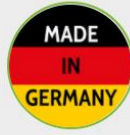
Made in Germany