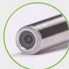
Sapphire negative & sapphire window

Solded sapphire negative and sapphire window advantages: no glue, no leakage and no scratches