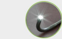
Stable guiding element

Increasing lifetime due to innovative construction method