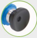
Standard eye piece

Optimal image setting through the ergonomic focusing ring