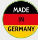
Made in Germany

Increasing lifetime due to innovative construction method