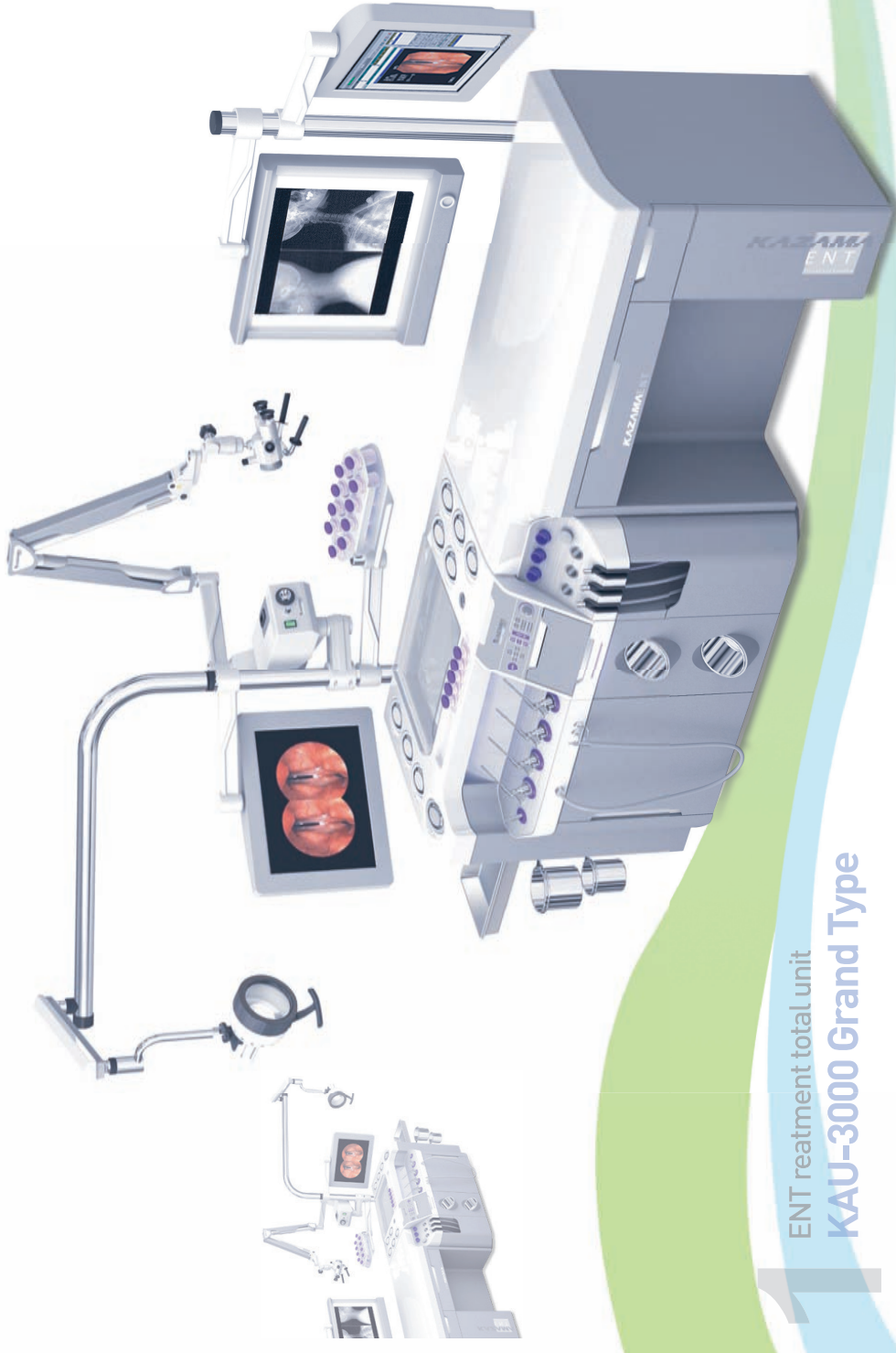
ENT treatment total unit KAU-3000 Grand Type